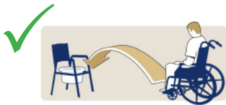
Chair to Commode/Toilet