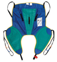
Oxford® MultiFit SL Reflex