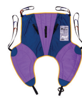
Oxford® MultiFit SL