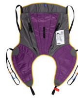
Oxford® MultiFit Reflex