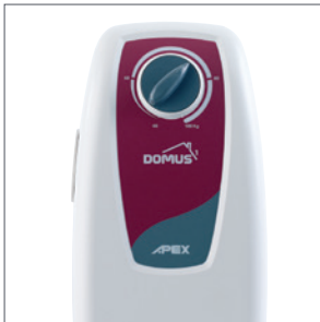
Simple intuitive pump design

The system is ideal for short term use and easy to install, the Domus 1 comes with an easy to use manual pressure adjustable pump and securing extension flaps, fitted to the head and foot end of the bubble pad to prevent the pad from sliding. The Domus 1 is designed to be a great first line defence against pressure ulcers in both the acute and community sectors.