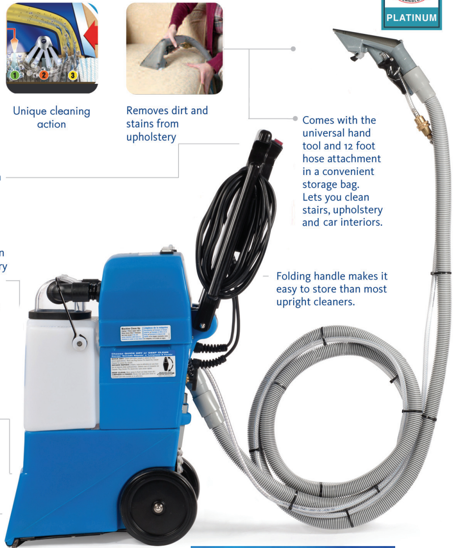
Folding handle makes it easy to store than most upright cleaners.