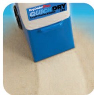
Superior one-pass cleaning