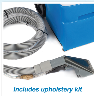
Includes upholstery kit

Wide range of Rug Doctor professional cleaning solutions available