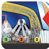
Unique cleaning action